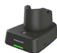
CCB-U00-G-KIT Contactless: CCB-U00-G-WCKIT