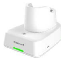
CCB-U00-H-KIT Contactless: CCB-U00-H-WCKIT

Access point for scanners. Class 2 Bluetooth, 10m (33'), RS232/USB/KBW/IBM (cable sold separately).