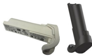
Black: BAT-SCN11WC White: BAT-SCN11WCHC

Smart battery: Lithium-ion battery for Xenon™ Ultra 1962 Bluetooth® scanners.