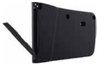
RT10-CAC - AVAILABLE IN US AND EUROPE ONLY